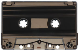
Smoky Tint MB-5422 (SONIC)