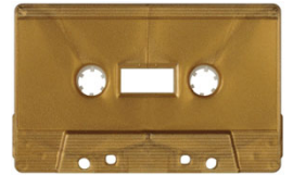
Gold Metallic MB-9822 (SONIC)

Recom'd Inks: All colors except Silver and Gray