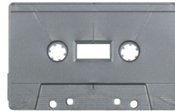
Silver Metallic MB-9922 (SONIC)

Recom'd Inks: All colors except Silver and Gray