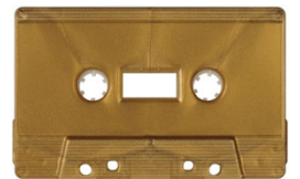
Gold Metallic MB-9822 (SONIC)

Recom'd Inks: All colors except Silver and Gray