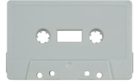
Gray Solid MB-8722 (SONIC)