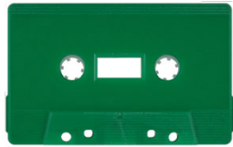
Dark Green Solid MB-2022D (SONIC)

Recom'd Inks: White, Black, Silver, Gold