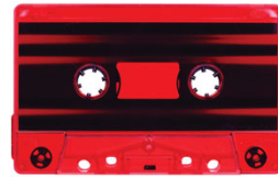
Red Tint MB-2622 (SONIC)

Recom'd Inks: White, Black, Purples, Reds, Silver, Gold