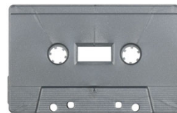
Silver Metallic MB-9922 (SONIC)

Recom'd Inks: All colors except Silver and Gray