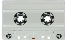
Clear w/Clear Liner MB-0322CL (SONIC)