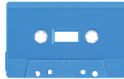
Light Blue MB-2722 (SONIC)

Recom'd Inks: White, Black, Blues, Greens, Silver, Gold