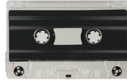
Clear w/ Black Liner MB-0322 (SONIC)