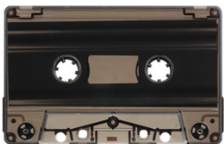
Smoky Tint MB-5422 (SONIC)