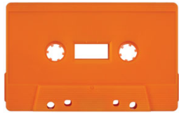
Orange MB-0722 (SONIC)

Recom'd Inks: White, Black, Silver, Gold