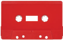
Red Solid MB-0822 (SONIC)

Recom'd Inks: White, Black, Silver, Gold