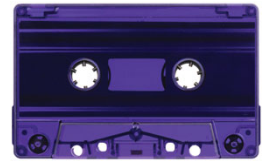
Purple Tint MB-3022 (SONIC)