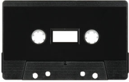
Black MB-0222 (SONIC)

Contact us to for a sample if you need to be sure of the exact color of a shell. Appearance of this document may vary due to screen and printer differences, and colors of shells and small details (such as liners or leaders) may change even within a manufacturing run of shells. Availability cannot be guaranteed.