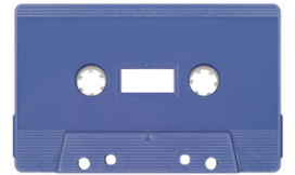
Purple Solid MB-2422 (SONIC)

Recom'd Inks: White, Black, Silver, Gold